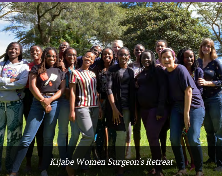
Kijabe Women Surgeon's Retreat