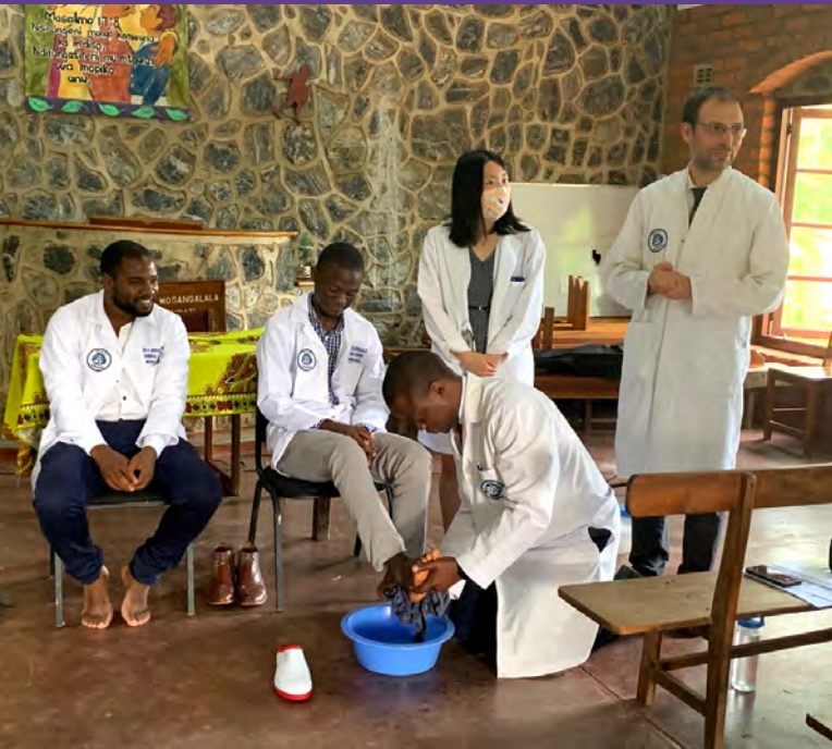
Faculty Wash the Feet of New Residents at Nkhoma Mission Hospital in Malawi