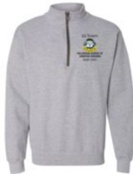
PAACS Embroidered Classic 1/4 Zip Sweatshirt - Sport Grey $30.00