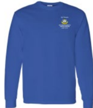
PAACS Screen Print Long-Sleeve Unisex T-Shirt - Royal $17.00