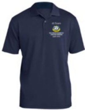
PAACS Embroidered Unisex RacerMesh Polo - Navy $30.00

Shipping is ONLY available within the United States.