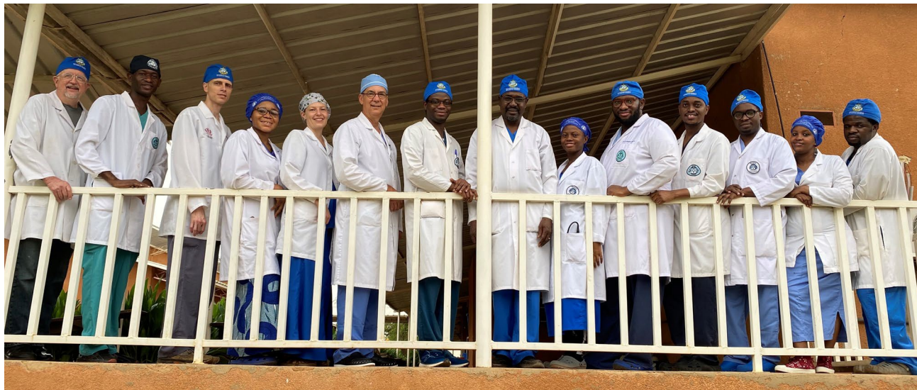
The PAACS-Galmi Team with visitors

time. All hands were on deck as patients were resuscitated, lacerations repairs and washouts of complex extremity wounds were carried out.