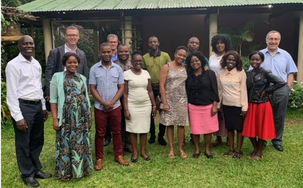
Attendees Day One of the PAACS-Malamulo Spiritual Retreat.