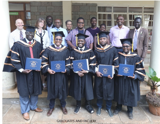
Kijabe graduates and faculty

Too many cooks ruin the stew – these many surgeons and only one knife?