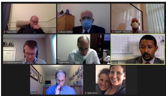
Screenshot of Zoom-based examination