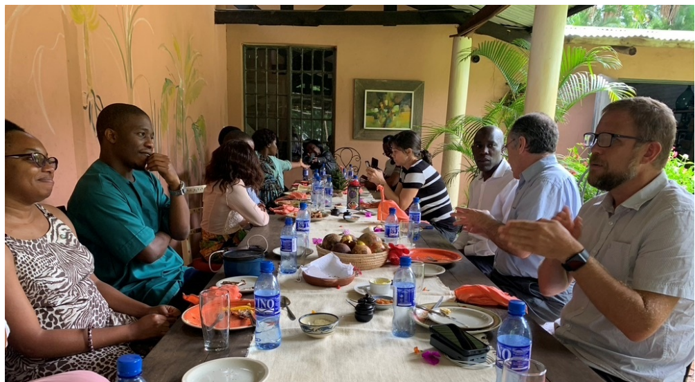
Mealtimes were also a time of great fellowship – and good food!