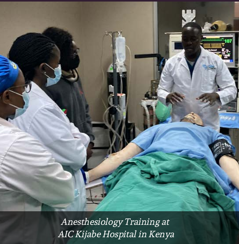
Anesthesiology Training at AIC Kijabe Hospital in Kenya