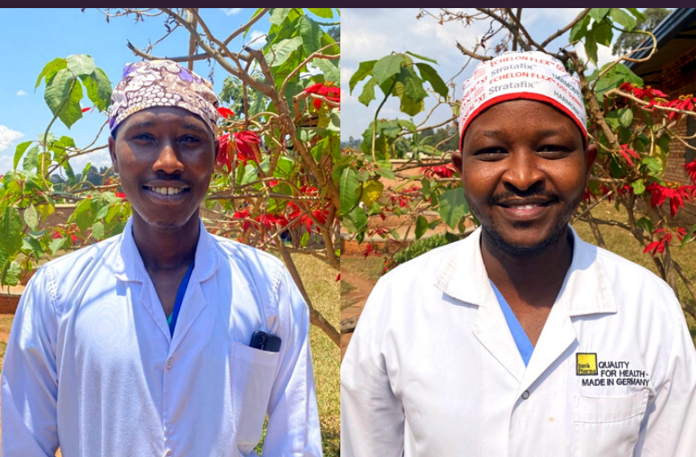
Two New Residents at the New General Surgery Program at Kibuye Hope Hospital in Burundi