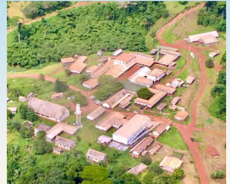
Bongolo Hospital, Gabon