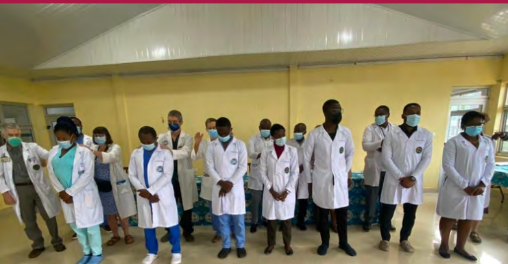
Whitecoat Ceremony at Mbingo Baptist Hospital, Cameroon