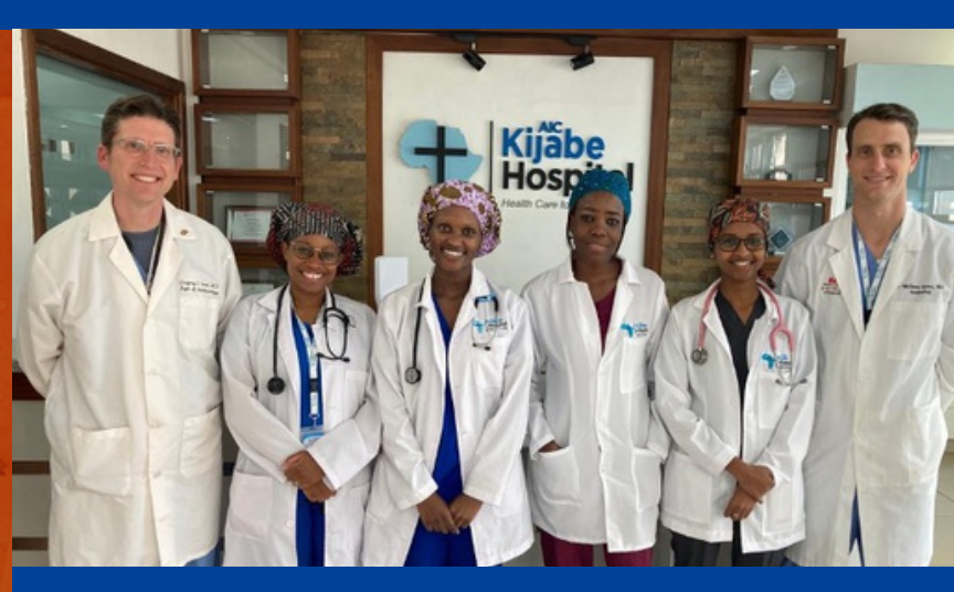
The PAACS Anesthesia Program at AIC Kijabe Hospital

Monthly Newsletter Issue #231 October 2023