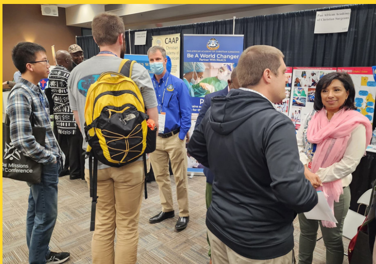
PAACS Booth at GMHC