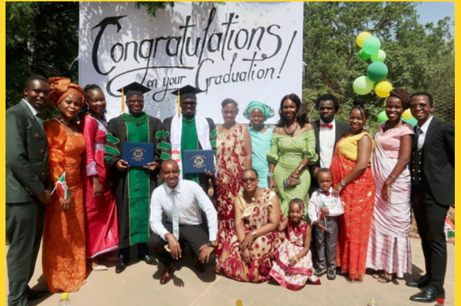
SIM Galmi PAACS residents and their families