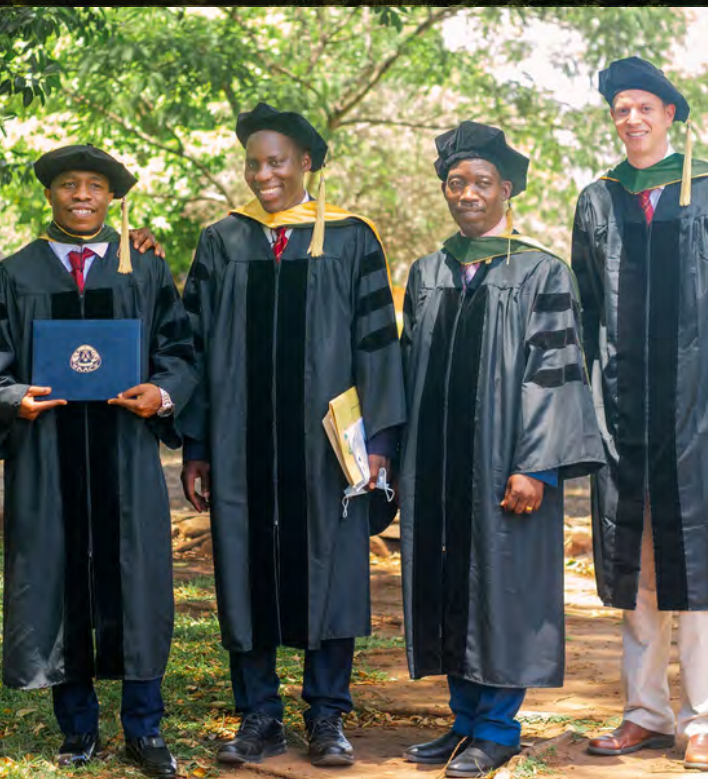
Graduation at Malamulo Adventist Hospital, Malawi