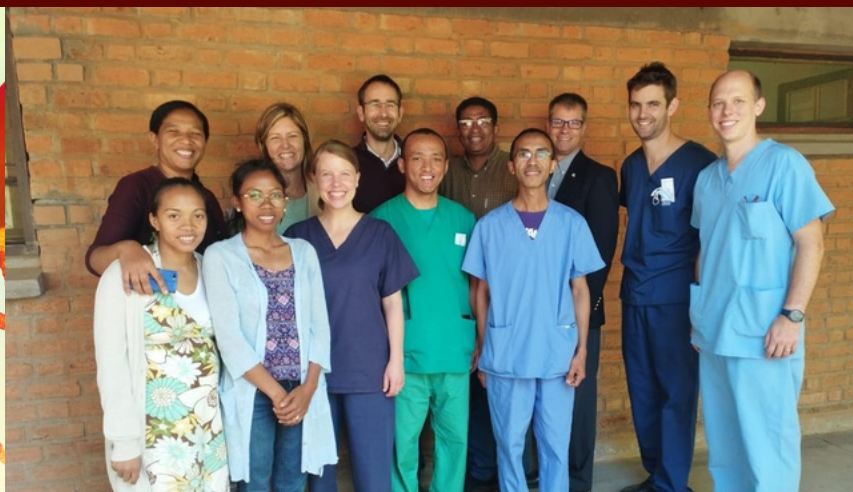
PAACS Faculty and Residents at Hopitaly Vaovao Mahafaly Mandritsara in Madagascar

Monthly Newsletter Issue #219 October 2022