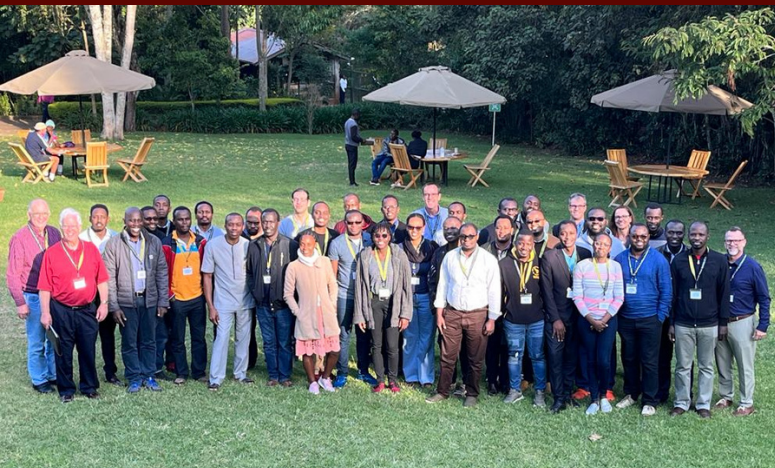
Senior Residents Conference