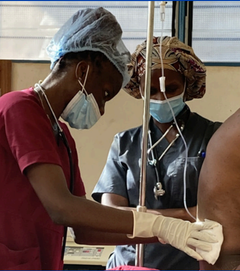
Anesthesiology residents completed rotations at Kibuye Hope Hospital in Burundi.

Monthly Newsletter • Issue 239 • June 2024