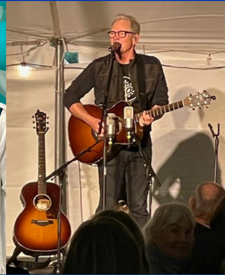
Over 160 people attended the Steven Curtis Chapman concert fundraiser.