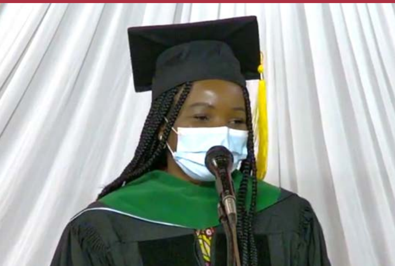
Graduation at Tenwek Hospital, Kenya