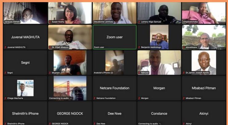
PAACS Alumni Virtual Gathering

We recently held a virtual gathering of PAACS alumni, witnessing the power of our growing network firsthand. Twenty-three graduates from around the African continent attended this Zoom meeting. The camaraderie and support shared among our alumni, both personally and professionally, was truly inspiring. Together they were able to inspire, strengthen, and pray for one another as well as problem-solve and share knowledge. This united front enables us to overcome challenges, celebrate successes, and foster an unmatched sense of belonging.