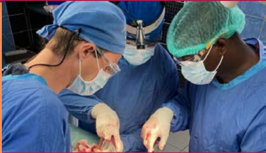
Inside the operating room at Bongolo Hospital