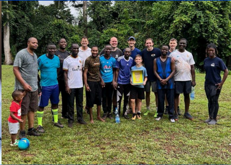
PAACS Soccer Match at Bongolo.